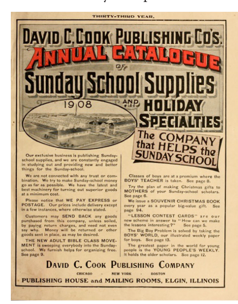
Figure 1: David C. Cook Publishing Company's annual merchandise catalog for 1908, complete with an image of the new factory as a selling point.

For press operators, deteriorating working conditions accompanied their evolving place within the company. The rapidity with which Cook introduced new equipment—in one instance bringing in five new presses in a month—led to a rash of workplace injuries as employees struggled to learn the new machinery. In one month in 1945 alone a printer's devil got his fingers caught in a proving press, a loose cam rolled onto the leg of another operator, and a warehouse worker had an entire pallet of paper fall on him. According to one worker, many in the plant had "the jitters" over the company's safety record.<sup>24</sup> As